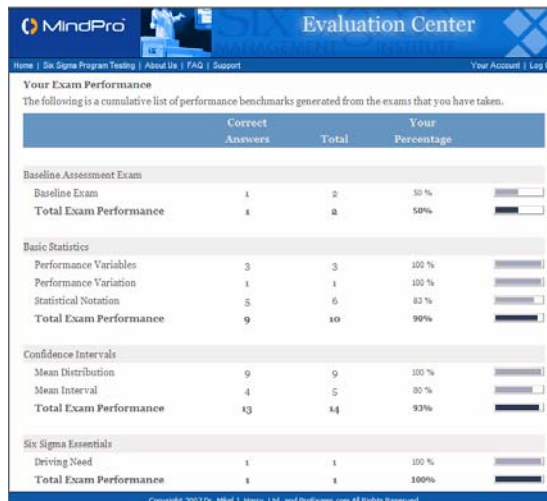
Figure 2.0 Example Display of Student Performance Feedback

Of course, the MindPro Evaluation Center allows students access to all of their previous exams, with the on-demand opportunity to review those exams. In addition, the system provides each student with several forms of feedback; including areas in need of attention, as well as pertinent references (see Figure 2.0).