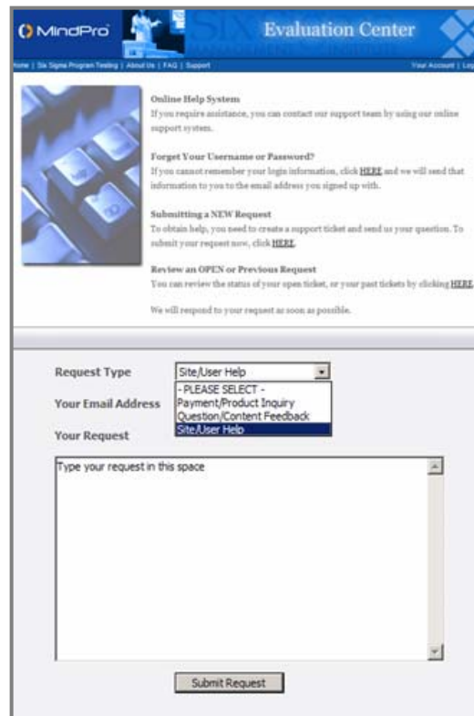
Figure 3.0 MindPro Evaluation Center Technical Support Communication Channel

Technical support is available by contacting the MindPro Evaluation Center through the communication tool displayed in Figure 3.0